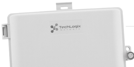
PERSONALIZE Custom Laser Engraving Your logo and information

Experience the ultimate in fiber connectivity with TheNID™ with Reel , featuring a preloaded rotating slack storage reel and versatile cable entry system. Eliminate in-field splicing, reduce installation time, and ensure reliable performance in any environment.